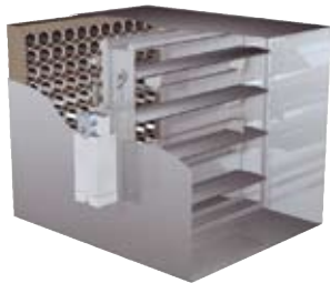
IAQ-42 with straightener requires a 12 inch (305mm) sleeve.

The IAQ-42 with a straightener is mounted in a sleeve; the spacing doesn't change based on the size that you need. The total space required is 12 inches (305mm)! The IAQ-42 with a 4 inch (101mm) or 6 inch (152mm) louver needs 16 inches (406mm) of space.